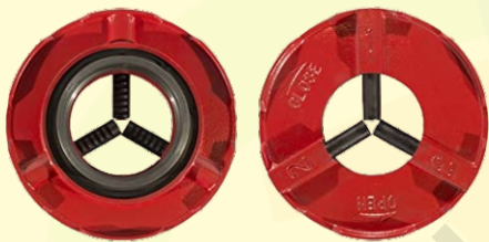
Rear Chuck Assembly