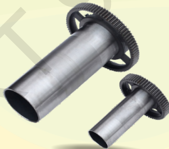
Gear Wheel & Bearing