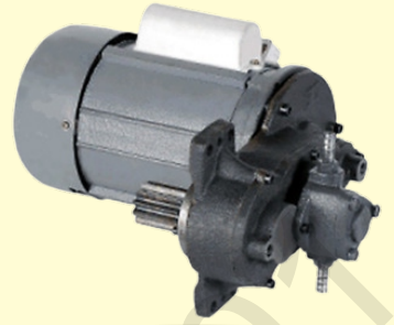
Motor With Gearbox