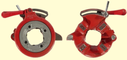
Die Head Assembly